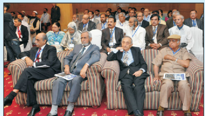
A pictorial view of Audience at 46th IEP Convention

Outlining the historical background of the Institution, he described the advancement of the IEP in recent years.