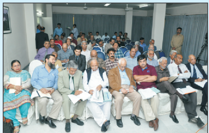
IEP Annual Report 2013, Budget Estimates of HQs & Centres and Audited Accounts for 2011-12 were presented during the 48th Annual General Meeting, and approved.