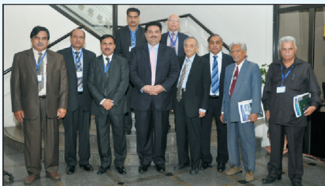
A Group Photo at 46th IEP Convention