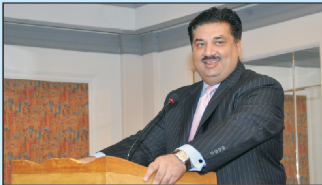
Engr. Khurram Dastgir Khan, Minister for Privatisation expressing his views at inaugural session of 46th IEP Convention

He was presenting the Welcome Address to the Chief Guest Engr. Khurram Dastgir Khan, Minister of State for Privatisation, Commerce and Textile Industry.